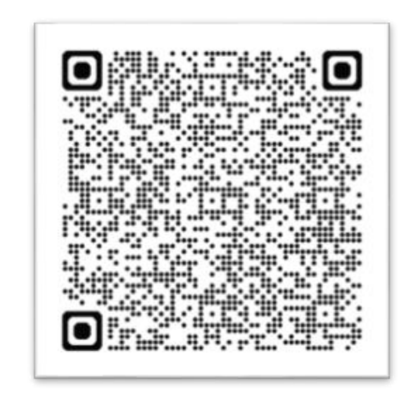
Click here for Treasury's selfservice resources