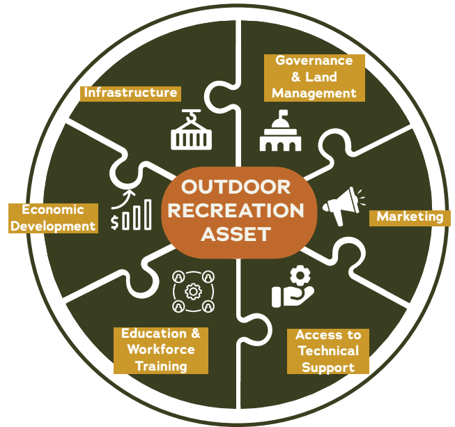
ORCA's Sustainable Model

IMPACTS & SUCCESS: Since September of 2020 ORCA and the AWOADC secured more than $10.8 MM in public and private investment to support infrastructure and programmatic development efforts surrounding development of the outdoor recreation economy in Southeast Ohio. 58 of the planned 88-miles of Baileys Trail System are complete and we offer MTB rental, bike gear, and merchandise featuring original, local art. Future projects include development of a ~5,000 square foot visitor hub, and a third trailhead.