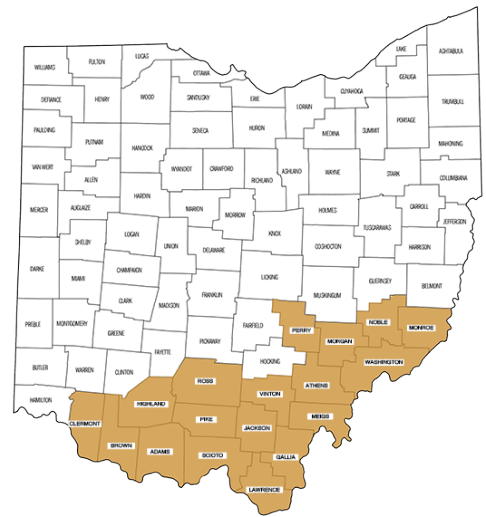
ORCA's Member & Partner Counties

In 2023 ORCA invited officials representing 18 neighboring counties to join ORCA as a Partners. Seventeen counties resolved to join, including: Adams, Brown, Clermont, Gallia, Highland, Jackson, Lawrence, Meigs, Monroe, Morgan, Noble, Perry, Pike, Ross, Scioto, Vinton, and Washington , as well as the Cities of Jackson and Wellston, and the Vinton County Parks District.