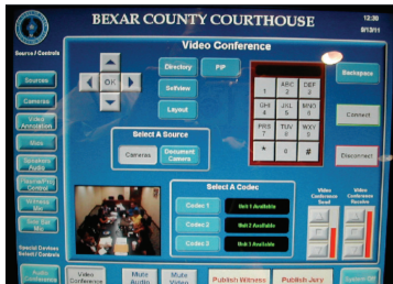
Touch panel that controls the system from judge's bench

Bexar County implements video teleconferencing system to increase efficiencies in judicial proceedings, saving county residents hundreds of thousands of dollars.