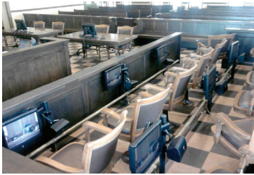
37th Civil District Court with Cisco video conferencing technology

Bexar County implements video teleconferencing system to increase efficiencies in judicial proceedings, saving county residents hundreds of thousands of dollars.