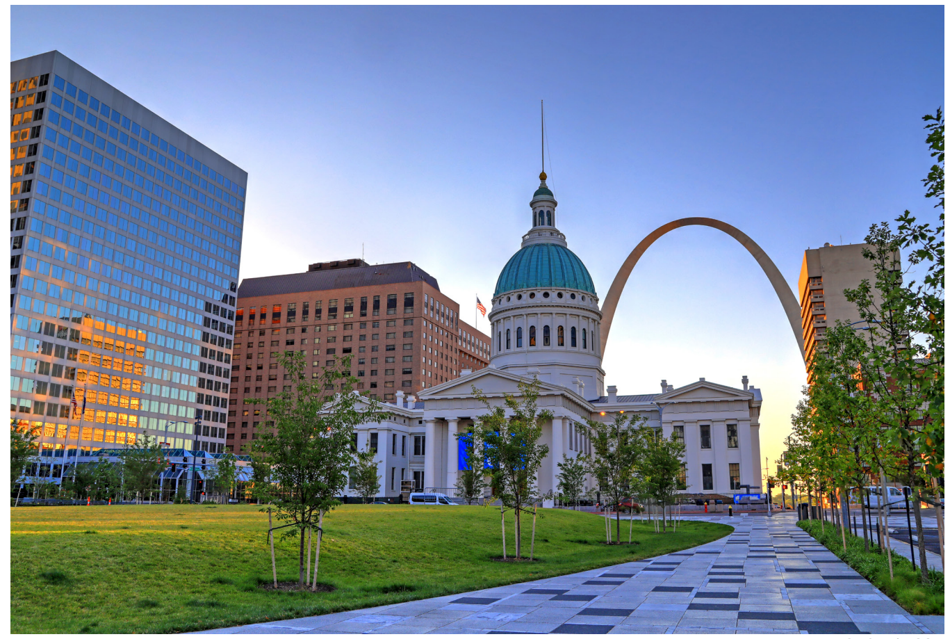
St. Louis, Mo.

However, with the ARPA expenditure deadline looming and many political leaders responsible for developing SLFRF spending plans beginning to transition out of office or face re-election, local leaders must start to think critically about how to sustain these initiatives in the long-term, including amplifying local capacity and collaboration and improving metrics to leverage the next wave of federal investments (e.g., from the Infrastructure Investment and Jobs Act and CHIPS and Science Act). This is a multidimensional challenge that requires local leaders to bridge across political cycles and leaders as well as address multiple domains such as financial sustainability, regional/crossorganizational collaboration, and capacity-building to result in broader impact and success.