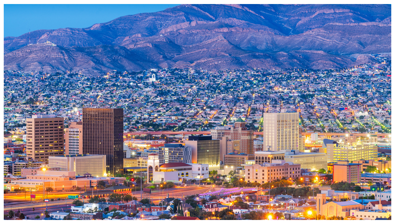
El Paso County, Texas

• In El Paso County, Texas, public health investments accounted for 36% of SLFRF commitments and 89% of SLFRF expenditures by the end of 2022. This includes a $35 million investment in the University Medical Center of El Paso, which delivers care to some of the county's most economically vulnerable residents. Reflecting on this investment, one county official remarked that the hospital district was the "foundation of [their] response" to the pandemic, serving as a "safety net" for Texans and New Mexicans living in a 280-mile radius of El Paso.<sup>24</sup>