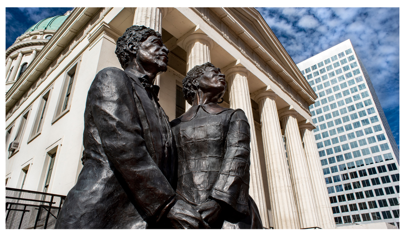
St. Louis, Mo.