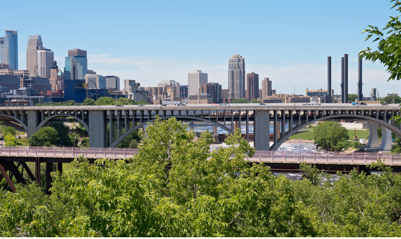
Hennepin County, Minn.