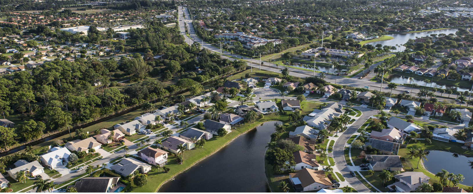
Palm Beach County, Fla.