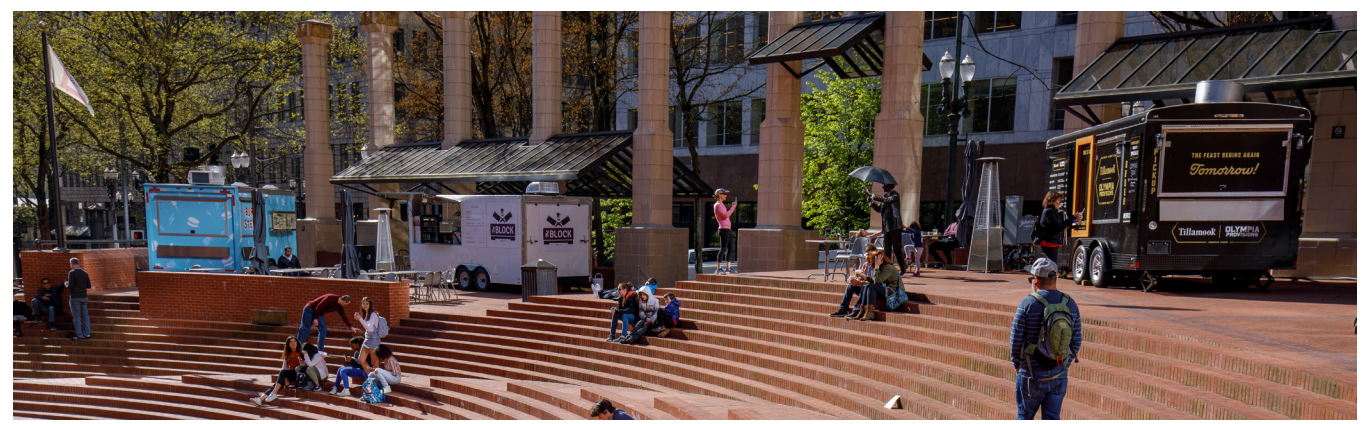
Multnomah County, Ore.