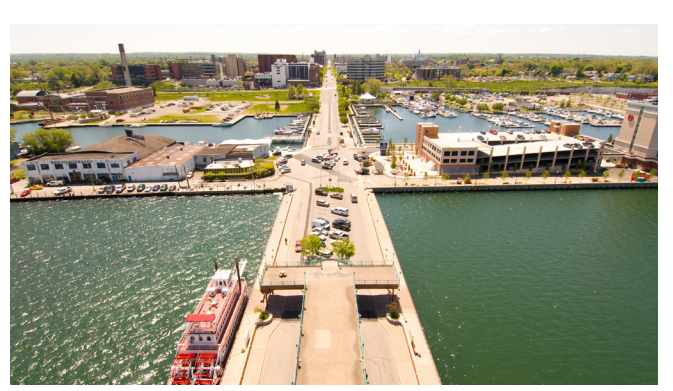
Erie County, Pa.

In Erie County, Pa. , regional intermediaries have also been critical in developing more comprehensive assessments of regional health to both contextualize the county's SLFRF investments and highlight areas of continued need. Through the Erie Vital Signs dashboard, the Erie Community Foundation is highlighting the health of the county's economy and business and talent ecosystem, as well as measures of overall livability. Through this data product, the Foundation is attempting to create a "shared vision for Erie's future, built on data" designed to "help Erie decide how to focus its resources to improve the community, and then to monitor the impact of those collective efforts."<sup>71</sup>