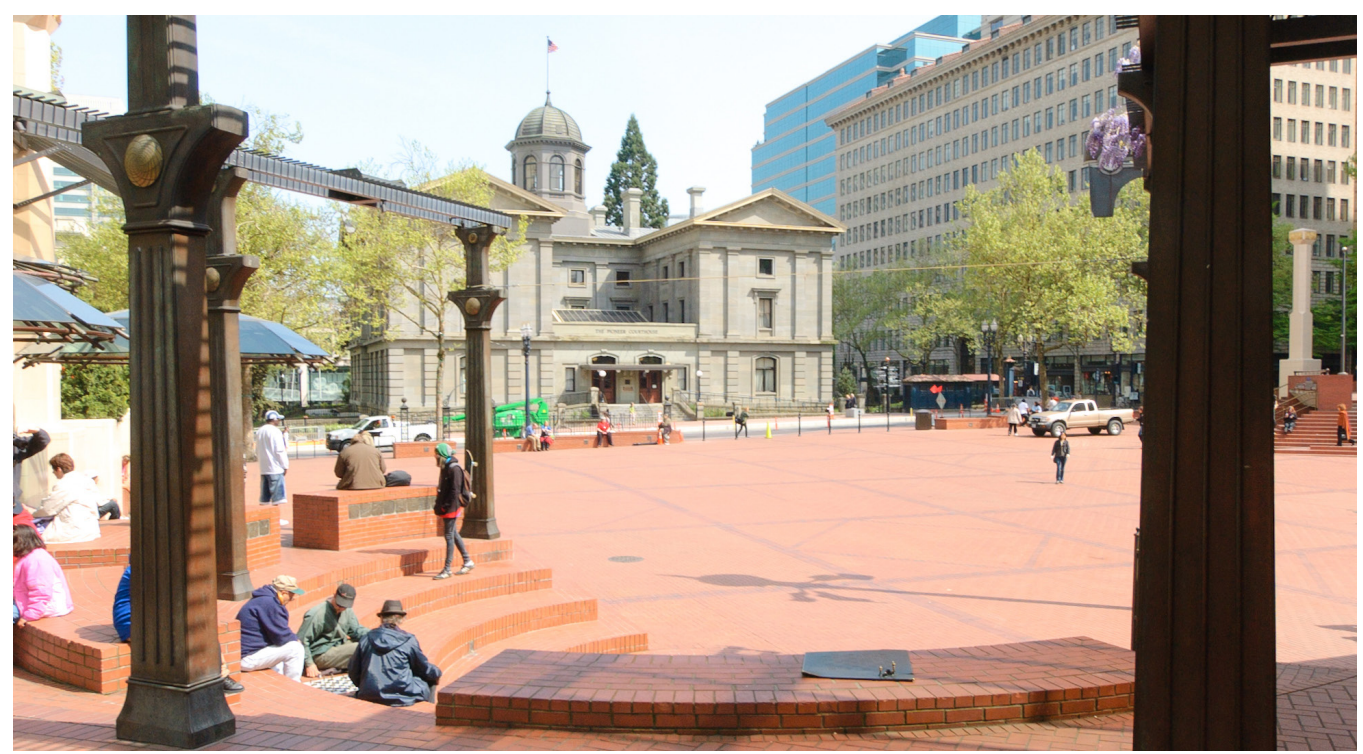
Multnomah County, Ore.

In other cases, the unprecedented funding formed the basis for development of new strategies. St. Louis Mayor Tishaura Jones' Economic Justice Action Plan described "a strategy to empower, develop, and transform the City of St. Louis through a vibrant, just and growing economy in which all people can thrive." Other examples include Birmingham, Ala. Mayor Randall Woodfin's Vision 2025 plan<sup>14</sup> and Cleveland Mayor Justin Bibb's Rescue and Transformation Plan, 15 which outlined 10 priorities meant to maximize the impact of this "once-in-a-generation investment." These newly elected or reelected leaders saw ARPA funding as a fortuitous opportunity to chart a new economic course for their city, even if it meant moving slightly slower through the priority-setting process than city and county peers with preexisting plans.