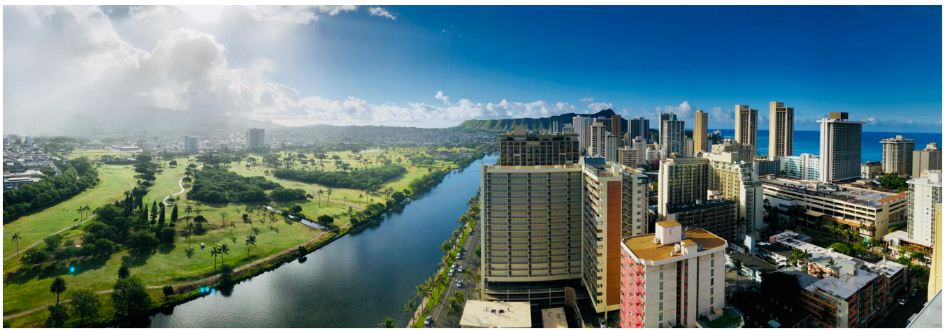
City and County of Honolulu, Hawaii

Longer-term investments in a more equitable economic recovery represented the second part of local dual-track approaches. In addition to addressing acute economic and health needs, the Treasury Department made clear in its Final Rule that the SLFRF resources were meant to also "support longterm growth, opportunity, and equity," and in doing so, ameliorate the underlying inequities that exacerbated the pandemic's impacts on disadvantaged communities.<sup>27</sup> Importantly, the SLFRF program recognized that getting resources into the hands of local decisionmakers would not only help address local governments' fiscal and operational challenges, but it would also help target federal dollars to match the varied economic and social conditions across those communities. In that way, these represent place-based investments in the nation's economic recovery, pushing local governments to confront several preexisting challenges that could undermine the implementation of large-scale, inclusive ARPA investments.