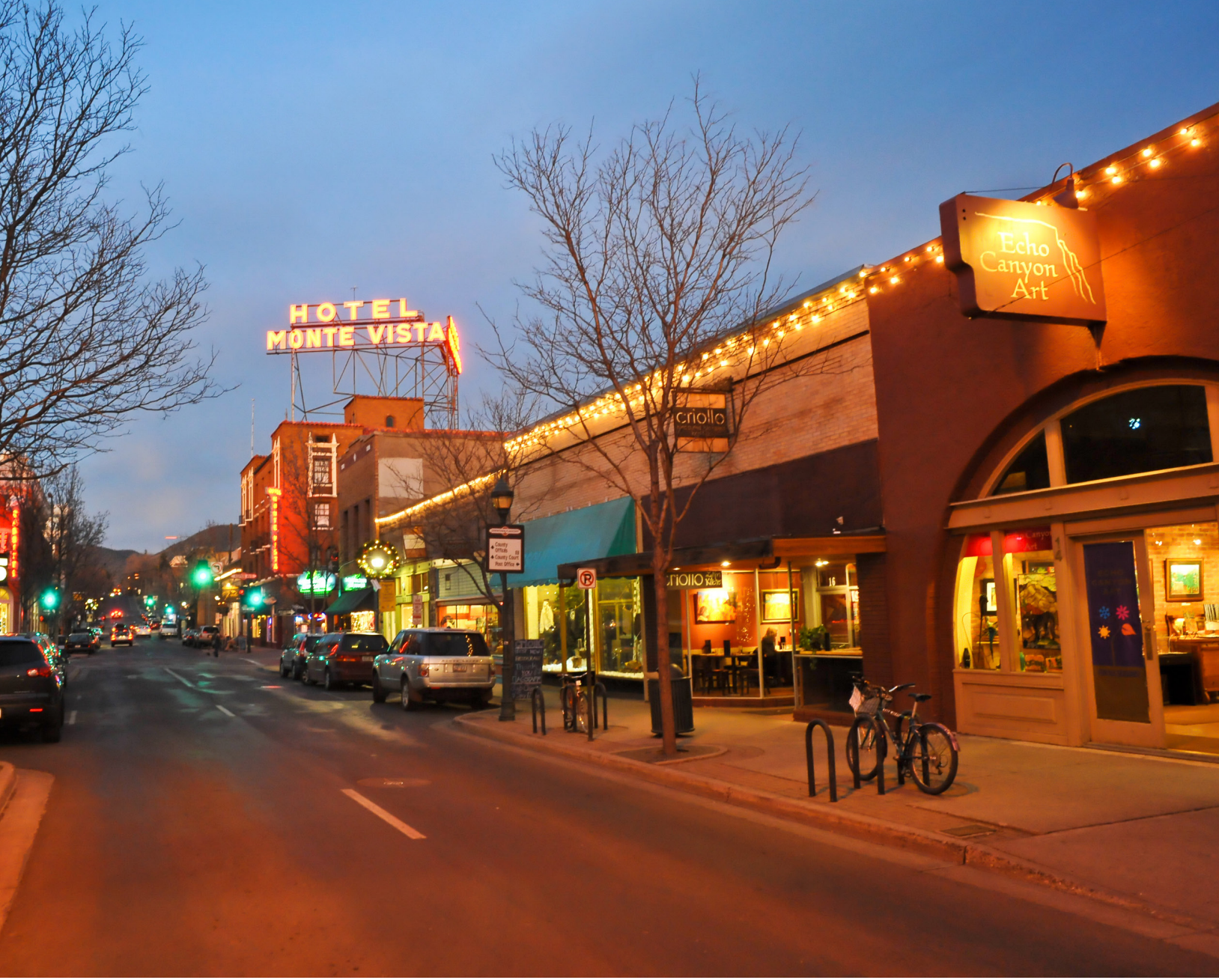
Coconino County, Ariz.