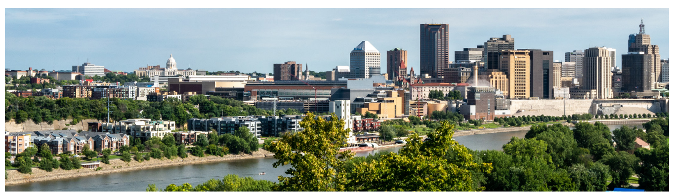
Saint Paul, Minn.