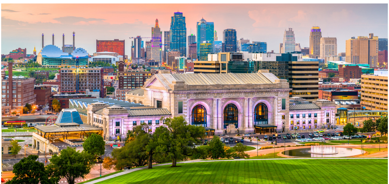
Kansas City, Mo.

Nevertheless, the very existence of documented, publicized community priorities—regardless of whether they were a product of a coordinated public process or built on an existing set of priorities—is a valuable outcome for communities across the country, likely creating positive, long-term effects that can continue to guide current and future spending and programs.